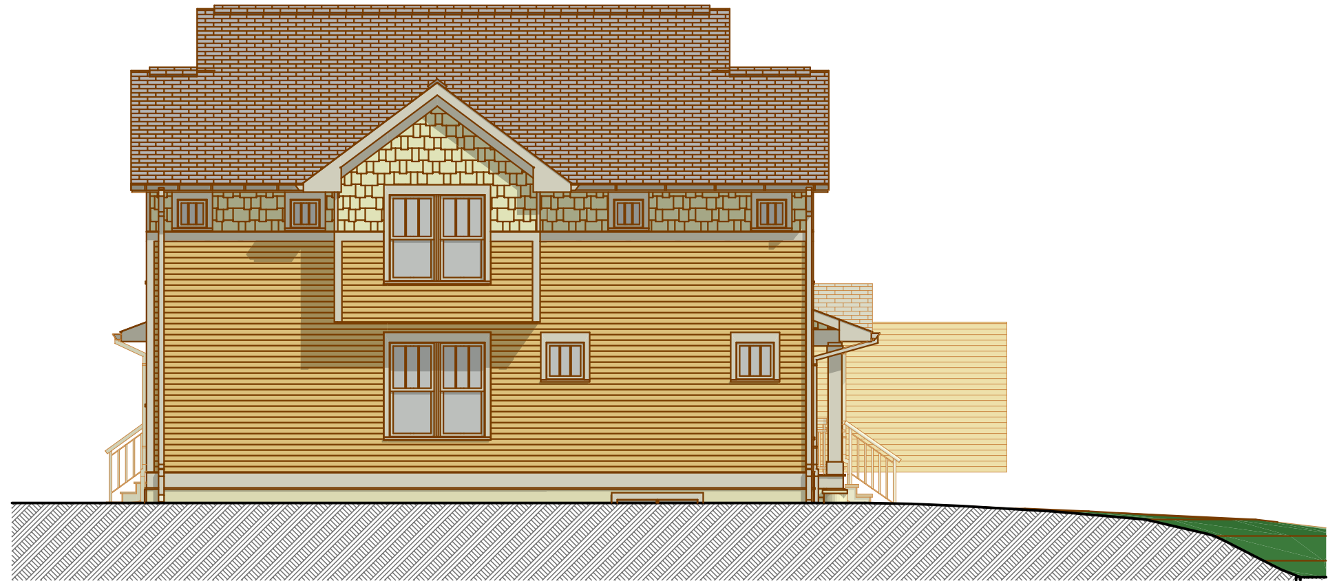
② SOUTH ELEVATION SCALE: 1/8" = 1'-0"